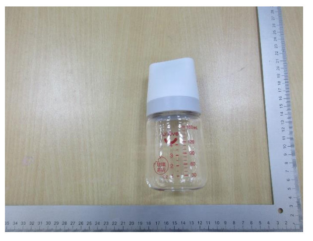
Item 2 Sample 2