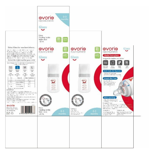
evorie Glass GNANCE N O