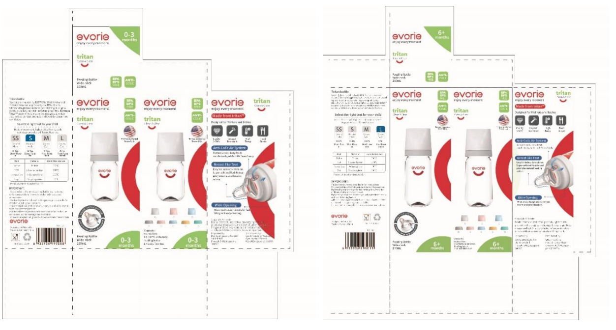
Packaging 1 The packaging was provided by client.