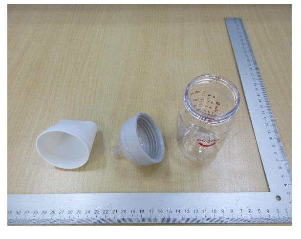
Sample 1 Sample 1A~1D