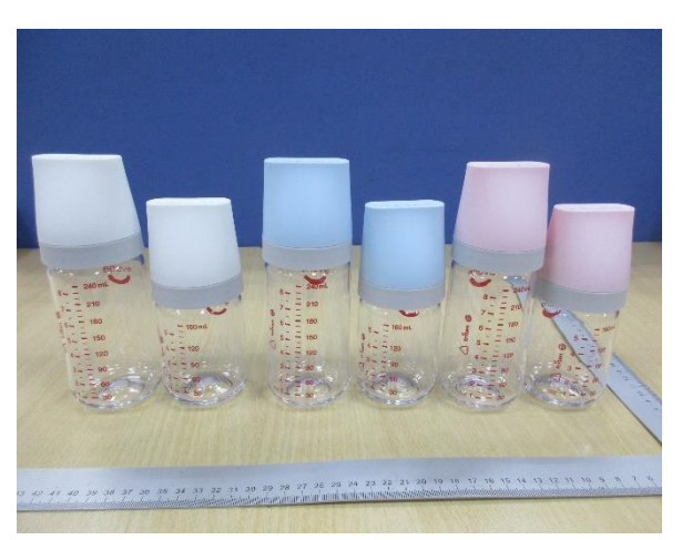
Item 1 Item 1