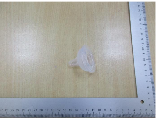
Item 3 Sample 3