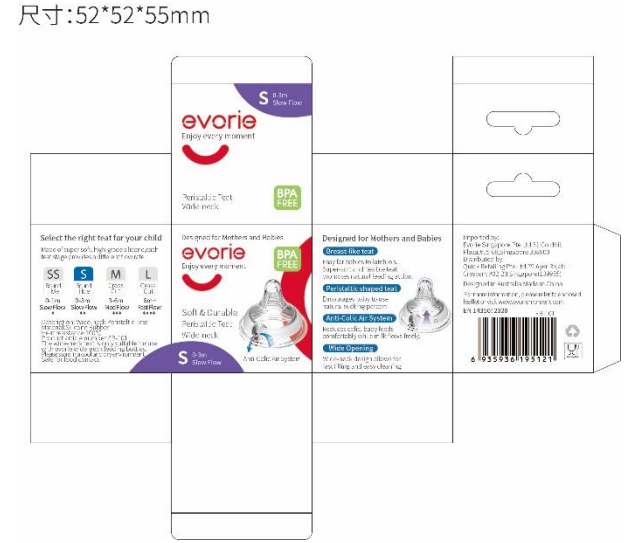
Packaging 1 The packaging was provided by client.