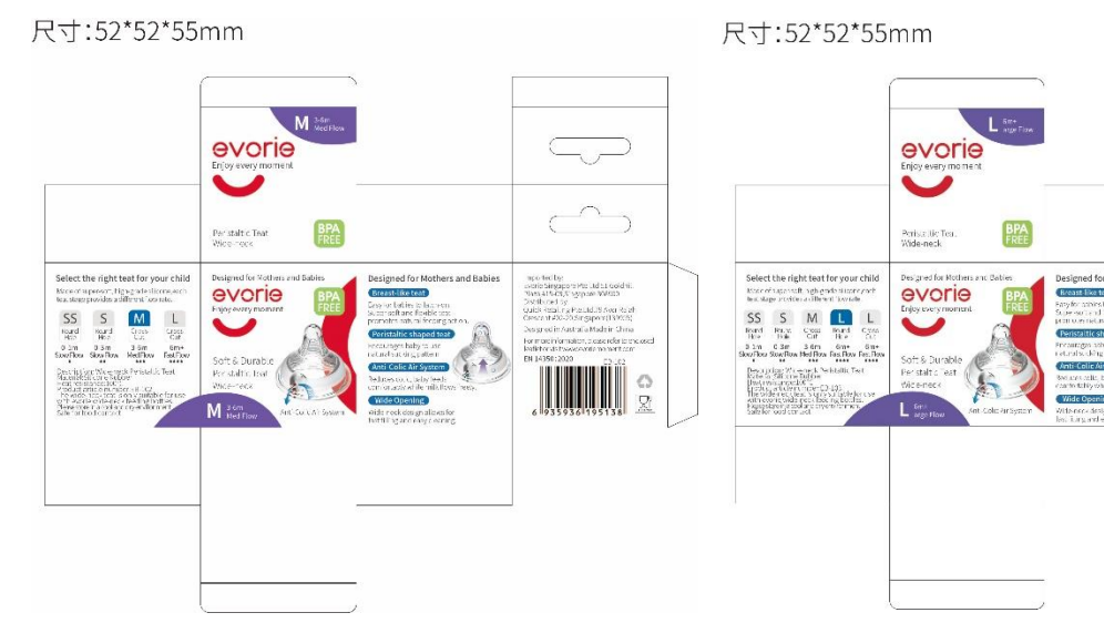
Packaging 3 The packaging was provided by client.